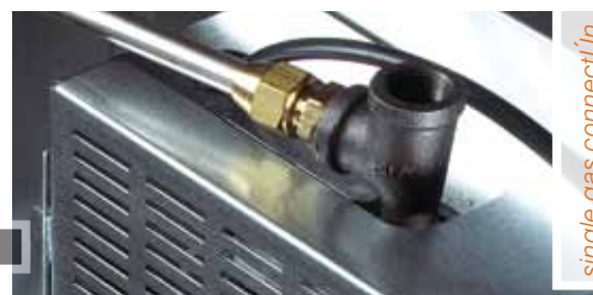
single gas connect