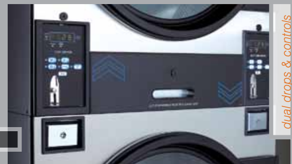
dual drops & controls