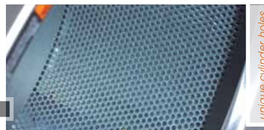
unique cylinder holes